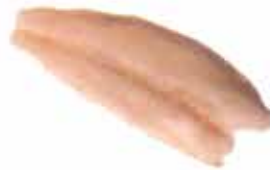
Sutchi (Dory) Fillet