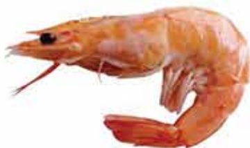
Vannamei Shrimp Head-on Shell-on