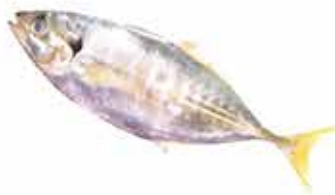
Yellow Tail Scad