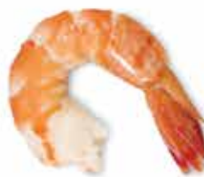
Vannamei Shrimp Headless Shell-on