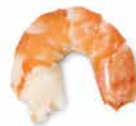
Vannamei Raw Shrimp Meat